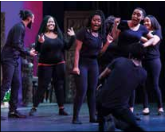
A community of youth and adult artists explore history through artistic expression in the annual theater production 'Who I am; Celebrating Me.'