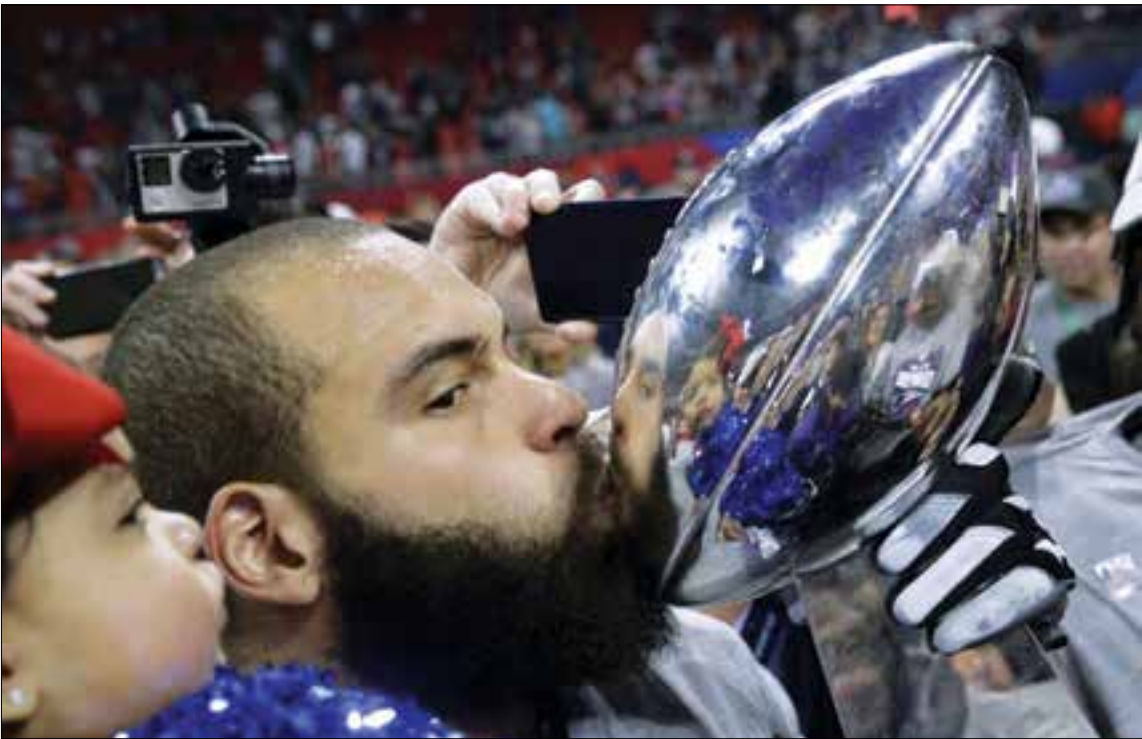
Lawrence Guy of the New England Patriots kisses the NFL championship trophy after his team won the Super Bowl Sunday against the Los Angeles Rams, 13-3.

(AP) — In a Super Bowl short on scoring, it was the New England Patriots’ defense that set the tone. The Patriots battered and bewildered quarterback Jared Goff and the Rams, stopping the NFL’s second-ranked scoring team en route to a 13-3 Super Bowl victory