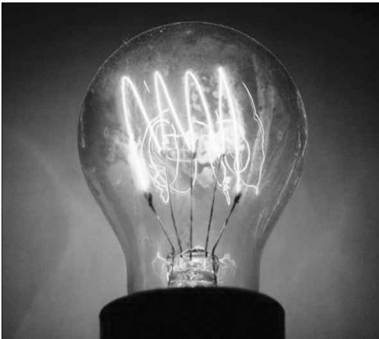
Full spectrum light bulbs bring in the sunshine.

Volunteers of America Oregon changes lives by promoting self-determination, building strong communities and standing for social justice.