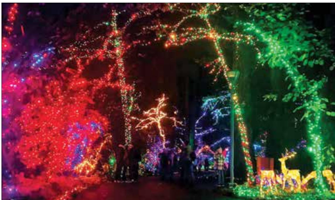
The Grotto's scenic pathways sparkle with colorful lights for the annual Christmas Festival of Lights, a northeast Portland tradition that runs nightly through Dec. 30 (except Christmas Day).

coupon must be present at time of order; expires 1-1-19