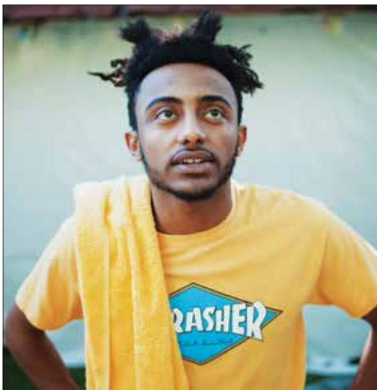
Aminé, a 24-year-old rapper from Portland whose debut single, "Caroline" peaked at number 11 on the Billboard 100 chart, is bringing his national tour to the Rose City with two concerts, Dec. 20 and 21 at the Roseland Theater.

Aminé is the son of Eritrean and Ethiopian immigrants and was born and raised in Portland. He was said to have wanted to play basketball in school, but was cut from Benson's basketball team. His rap career then began to come into fruition when he would make diss tracks about rival high schools, Grant and Lincoln, according to a profile about the artist.